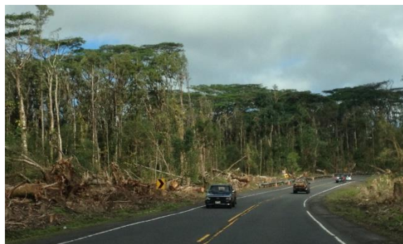
This picture was taken by Bishop Matsumoto when he visited the disaster-stricken area on Big Island.