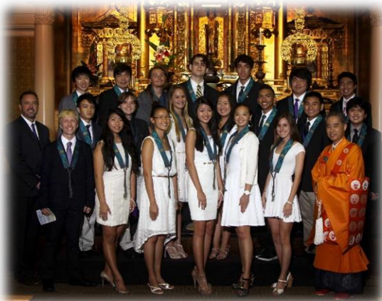
Baccalaureate Service at Honpa Hongwanji Hawaii Betsuin on May 8, 2014