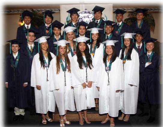
Commencement Exercises at Japanese Cultural Center of Hawaii on May 9, 2014